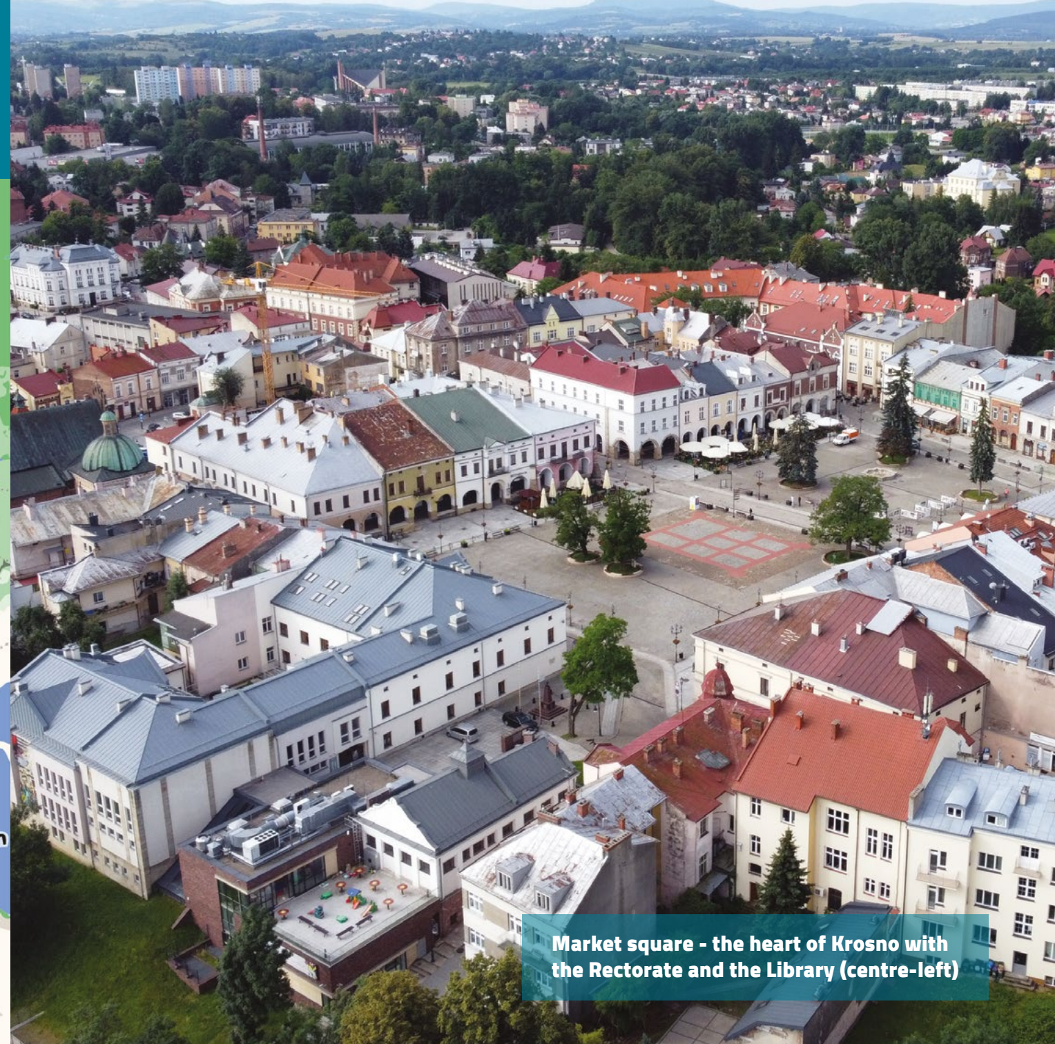
Market square - the heart of Krosno with the Rectorate and the Library (centre-left)