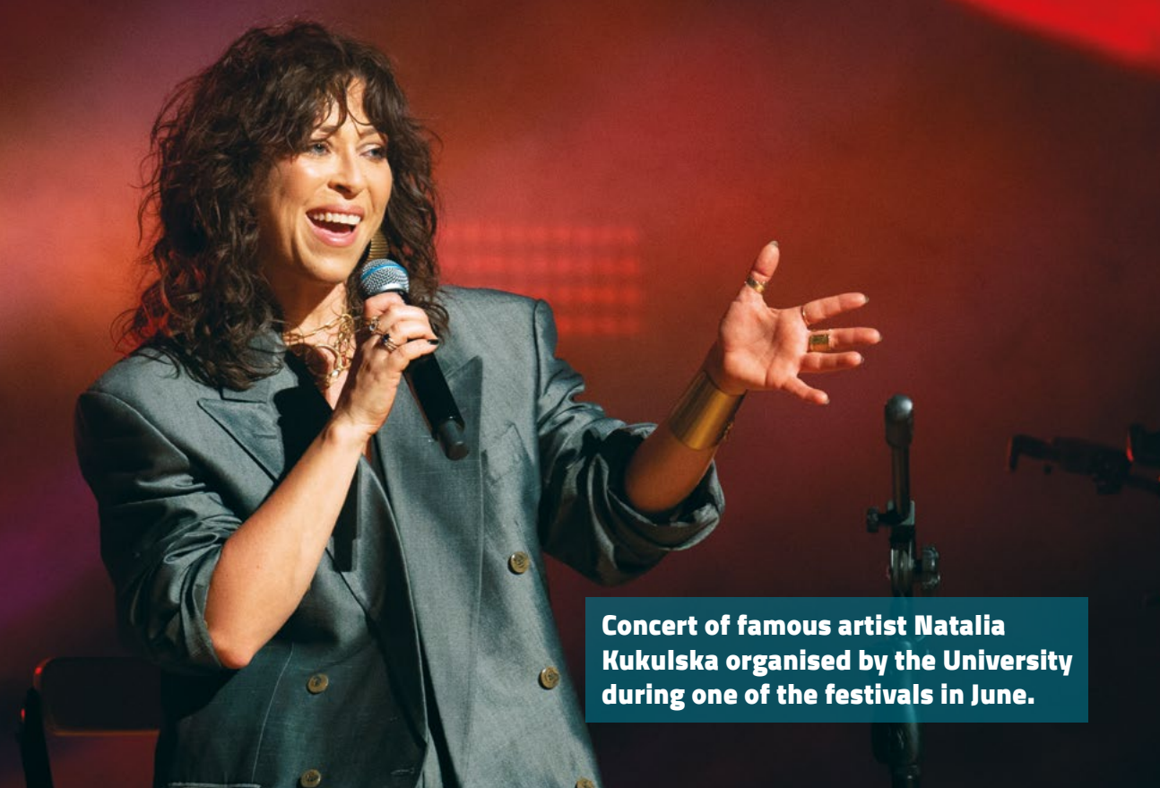
Concert of famous artist Natalia Kukulska organised by the University during one of the festivals in June.

do not usually use dubbing. BWA (Bureau of Artistic Exhibitions) offers regular exhibitions of paintings of artists from various countries. Annual student festival, come to Krosno, be part of it!