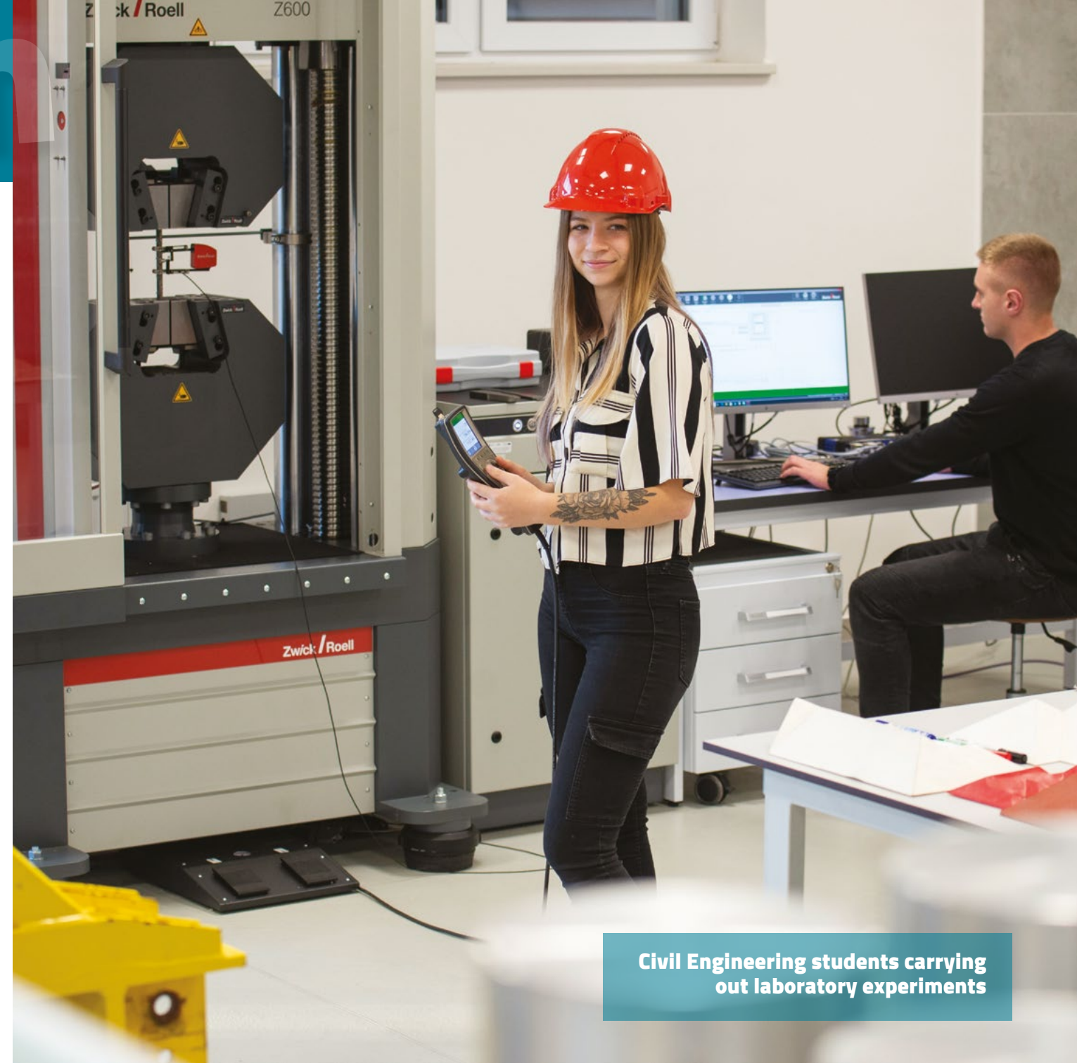
Civil Engineering students carrying out laboratory experiments